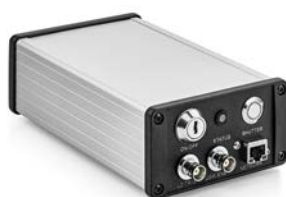
Laser controller unit