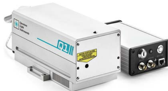
Laser head Q1 with controller unit