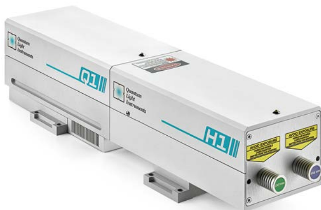
Laser head Q1 with attached harmonic generator module H1

14) Laser can be powered from appropriate 12 VDC power source. Please inquire for details.